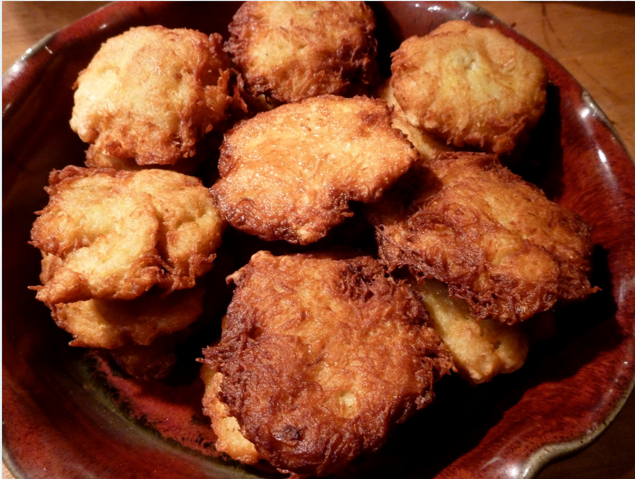
granted under creative commons licence - attribution